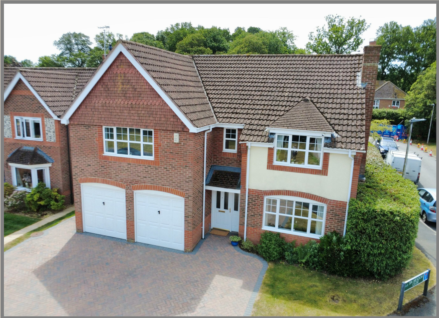
Spa Meadow Close, Newbury, RG19 8ST